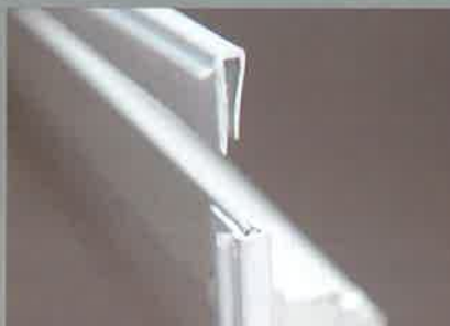
SELF-SEALING DUAL DUROMETER VINYL THERMAL BREAK