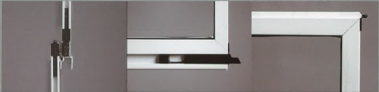
MECHANICAL INTERLOCKING MEETING RAIL